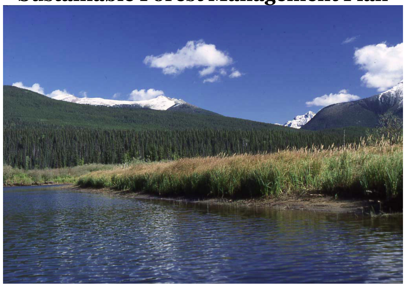
2011/12 Annual Report